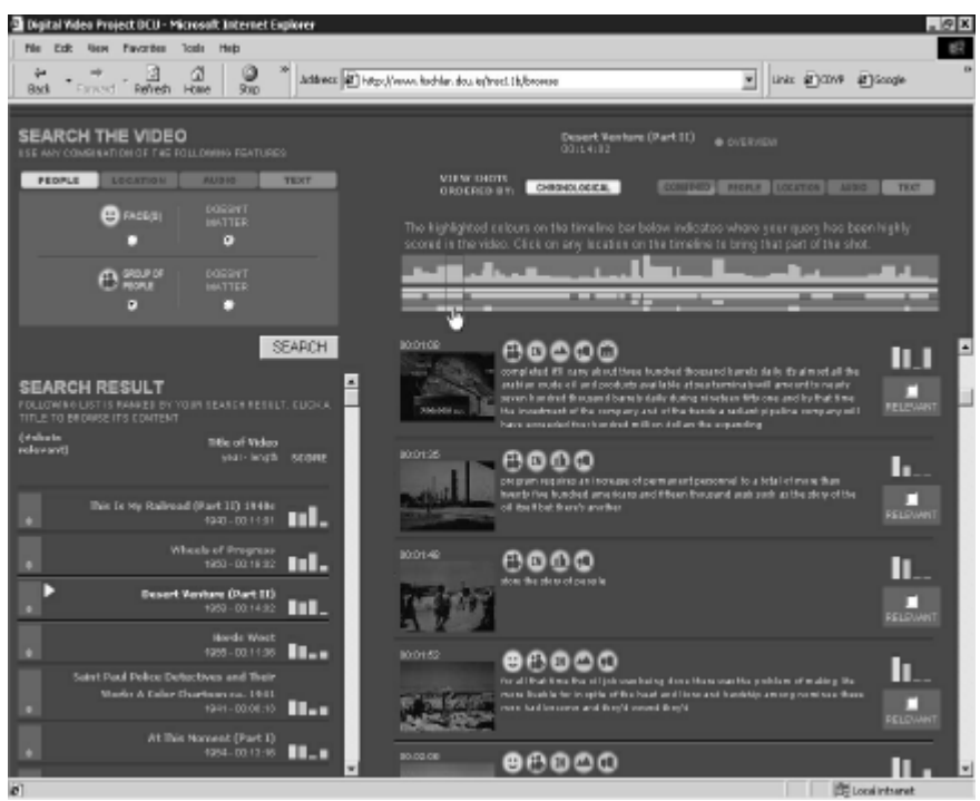
Figure 2 - The Fischlar-TREC search and retrieval interface