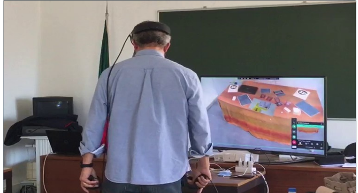
(Police officers from Policia Judiciária during PUC2 implementation)

The technology provided by the CONNEXIONS platform allowed to assist officers during the preparation phase in implementing the best security measures for investigating a location involved in a human trafficking case through the use of a Virtual Reality (VR) application. In addition, in the operational phase, it allowed officers and those commanding them to get an overall idea of the situation through the use of Body-Worn Cameras (BWC) and Augmented Reality (AR) glasses and allow to mobilise teams in real time.