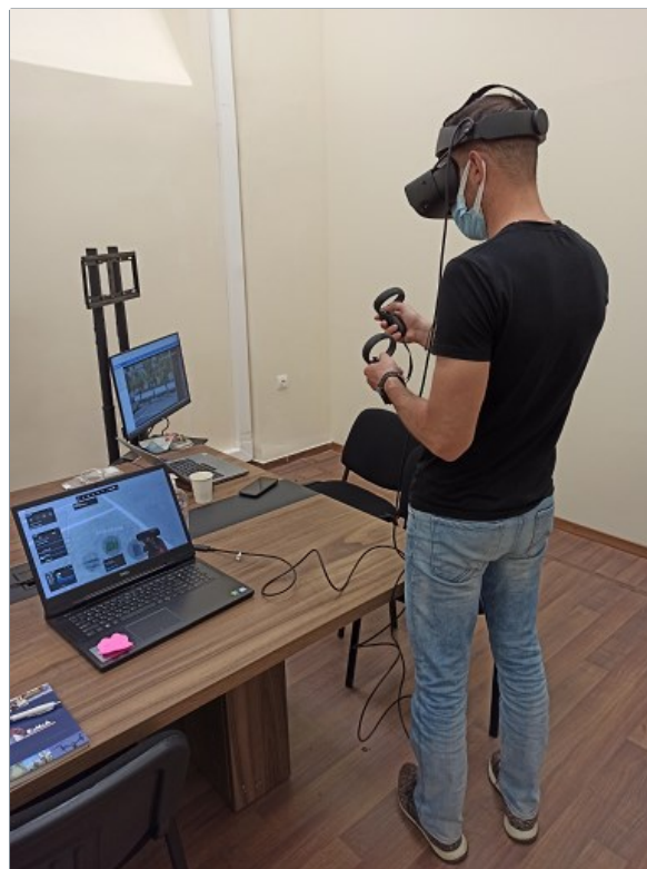
(Hellenic Police Officers during the PUC1 implementation at KEMEA premises)

The 2 nd iteration of PUC1 was successfully completed and all functionalities were tested according to the plan. Hellenic Police officers were impressed by the capabilities of CONNEXIONS platform tools , and they recognised the potential of these tools to improve the performance of their operations and reduce time and effort .