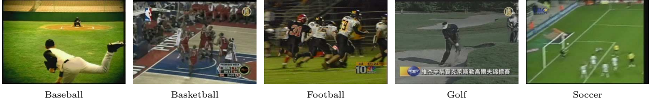
Figure 3: Shot keyframes of the five events.

represent each training shot keyframe with a 100-dimensional feature vector, and the 101 trained concept detectors are used to further map the BoW feature vectors to 101-dimensional model vectors, as explained in section 2.3.1. The resulting model vectors are used by the referencing mechanism for learning the event classes. During testing the same procedure is followed to represent the test shot keyframe with a 101-dimensional model vector and the trained referencing mechanism is used to index the non-annotated shot with one of the considered events.