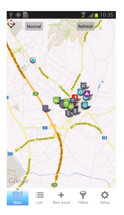
Figure 2. Map-based view of all issues in a city

<sup>6</sup>http://mklab-iti.github.io/ImproveMyCity-Mobile/