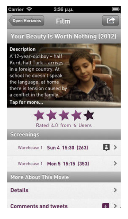
Figure 3. Mobile app for festivals